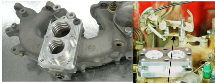
Bell Crank Assembly